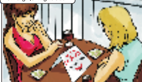
Sue notices a vodka promotion on the table...