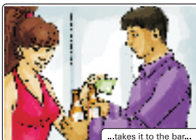
...and gets a free bottle of vodka.